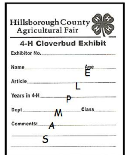
This tag is Green for Cloverbuds